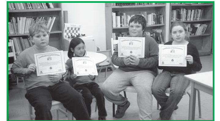
Students at St. Joseph's All-Grade, Croque.