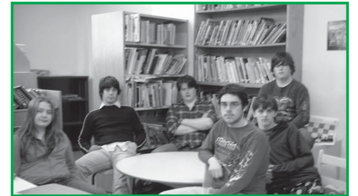
Students at St. Joseph's All-Grade, Croque.