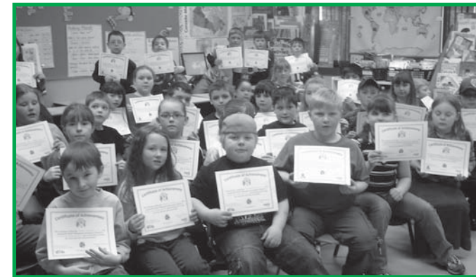
Students at Cloud River Academy, Roddickton.