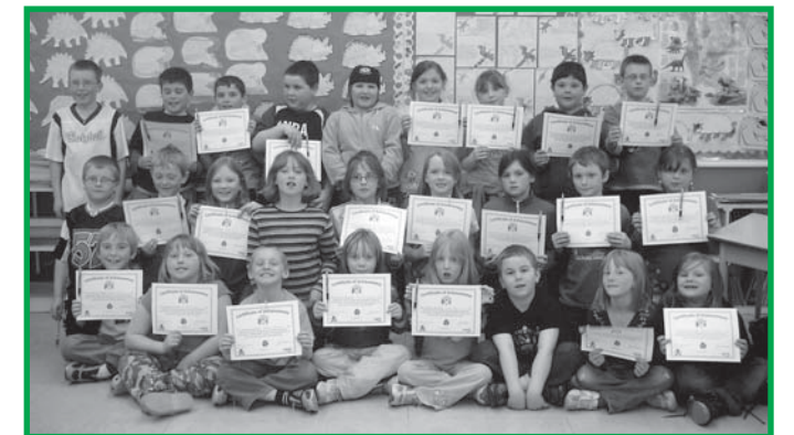
Students at St. Anthony Elementary.