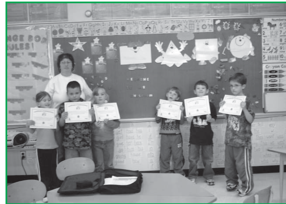
Students at James Cook Memorial School, Cook's Harbour.

Once again we are well underway in our school year. NWMA would like to remind schools in our region that we are available and willing to do waste management classroom presentations. New lesson plans have been developed to accommodate all grades and levels.